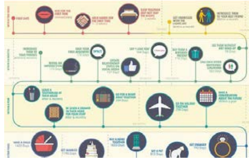
Some relationship milestone

There were several words that popped up to my mind when I thought about vacation. For me vacation is journey where I discover something new and reaching new level. I tried to think of what kind of abstract journey and what will be the final destination. And I saw this short video about Relationship milestone. I thought it can be the time when you go inside deeper to one person and it can be new journey.