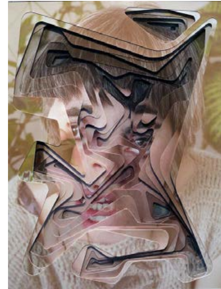
Exploring multiple layer