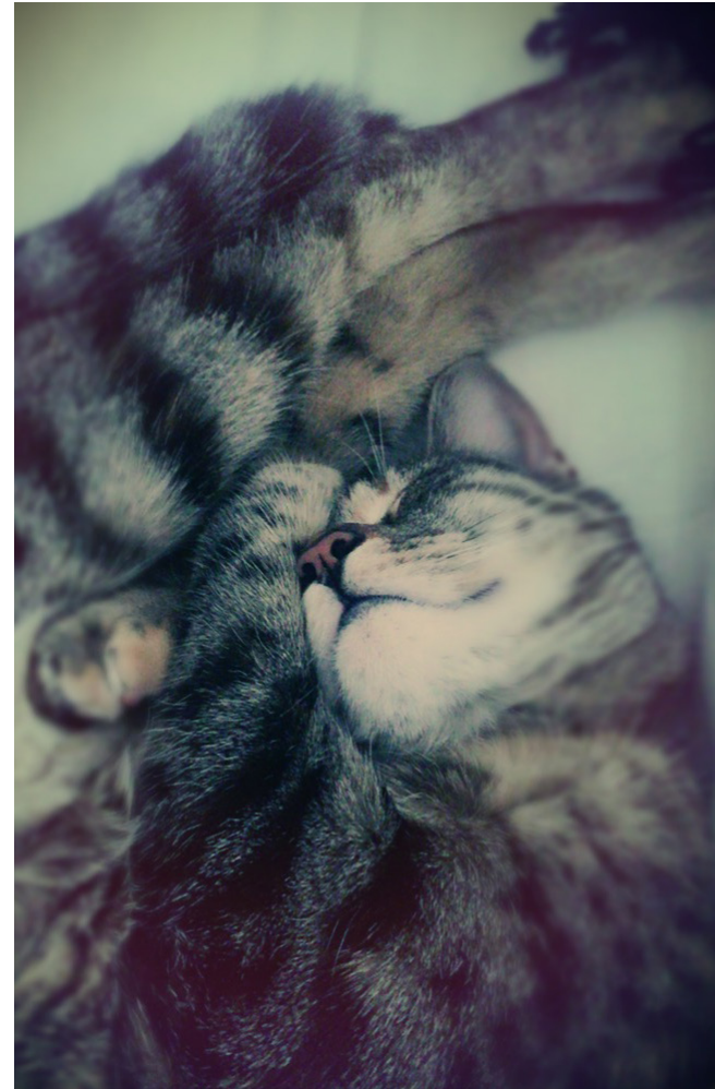
Mosaic photography work