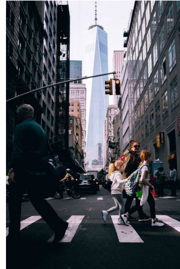
examples of cross walk